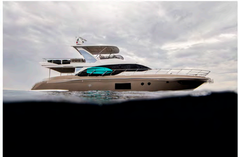
Mi Bluu | 66ft Azimut +$55,000 USD (7 day trip)