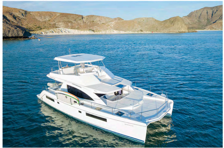
Pacifico | 51ft Leopard +$16,000 USD (7 day trip)